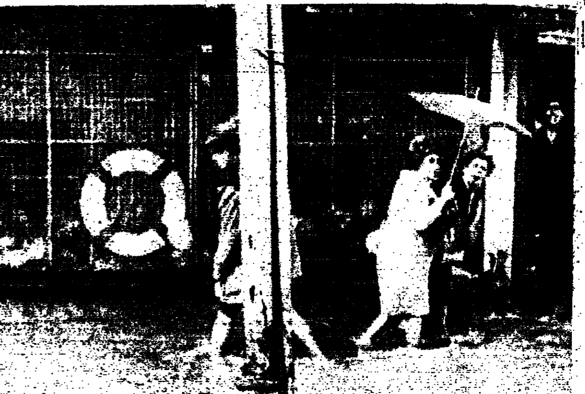
Pedestrians in Jaffa wade through an ankle-deep lake that is in Sderot Yershalayim in wake of yesterday's rain. Picture was taken at the corner of Rehov Hakekuma, where sporting goods store festu life-saver in its window.